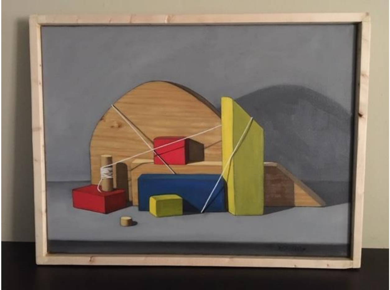
Arrangement 2 with primary colors – 2018