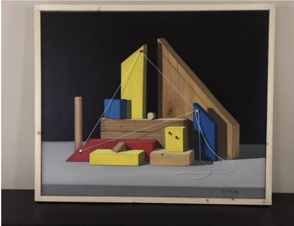
Arrangement 1 with primary colors - 2018